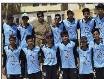
Inter School Matches